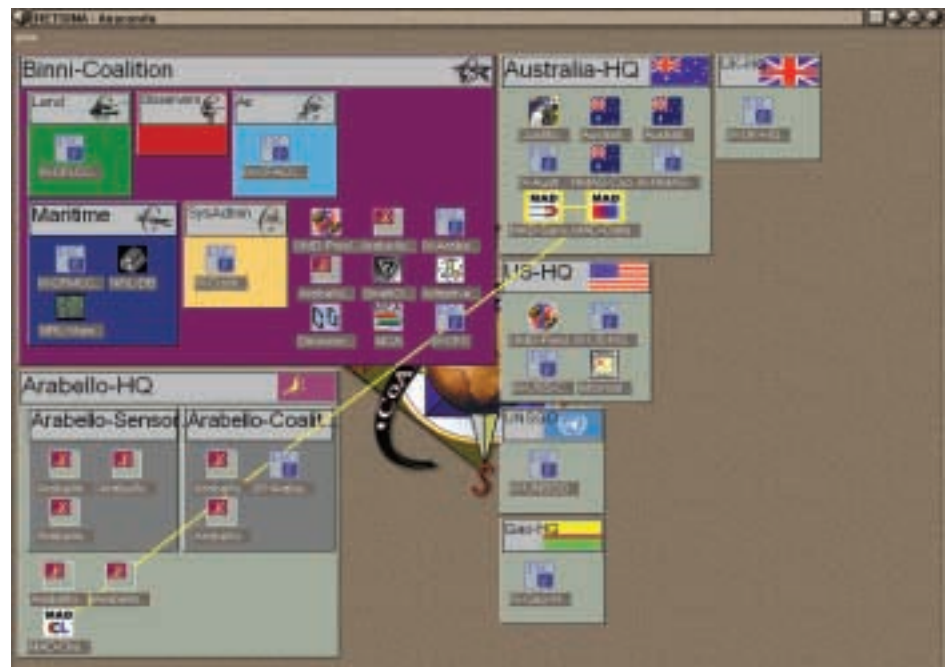
Figure 2. Agent Domain structure used in the CoAX Binni 2002 demonstration. Each domain contains a variety of agent. Domain nesting indicates a hierarchy of responsibility and control. Inter-agent activity can be visualised as part of full-spectrum dominance.

Control Policies. The increased intelligence that software agents provide is both a boon and a danger – agents can perform tasks